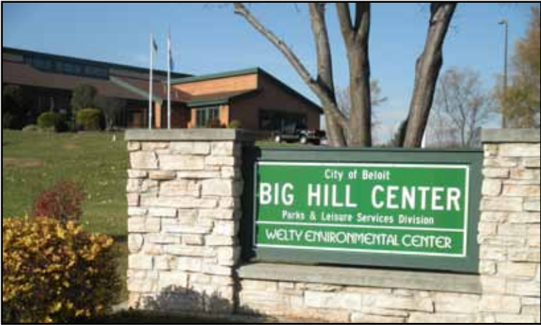
The new sign announces Welty's presence at the Big Hill Center, shown in the background.

The Big Hill Center was built more than a decade ago by the Badger Council of the Girl Scouts of America. It was purchased last year by the City of Beloit, which rents about 1/3 of the building to the Friends of the Welty Environmental Center, Inc. We are pleased to call this facility our new home.