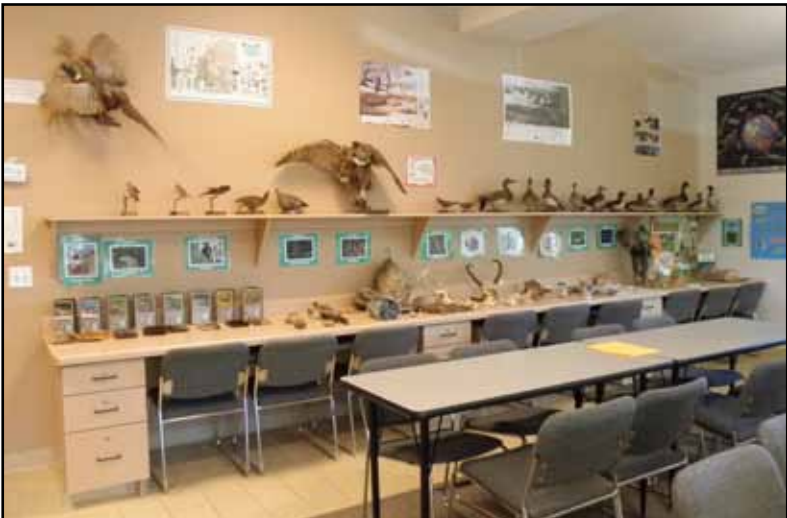
An inside view of Welty's Environmental Teaching Space at the Big Hill Center.