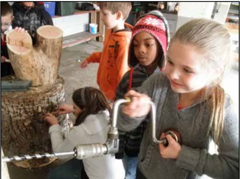
Students learning how Maple trees are tapped, get hands-on experience drilling holes in a practice log.