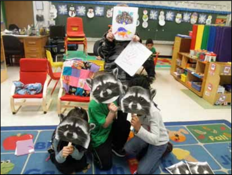
Gaston Elementary School students, pictured here, learn about their school mascot with an outreach program located at Gaston School and offered through the Welty Environmental Center.