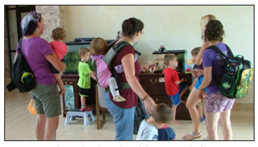
Welty Wednesday Kids and their parents look at live Turtles in two tanks at the Big Hill Center.

Samantha has become a voice in the much needed efforts of habitat protection and restoration. Through education, she hopes to nurture the next generation of conservationists, eager to protect our natural resources.