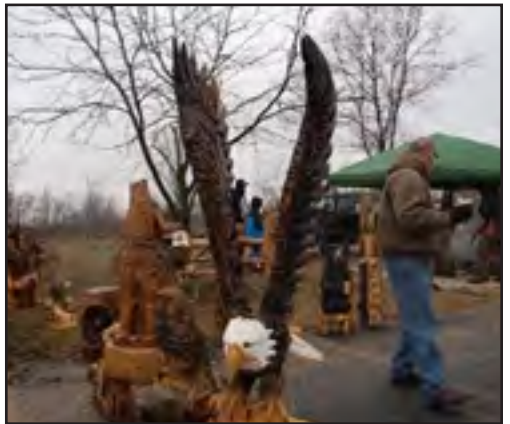
Chain Saw Woodcarvers