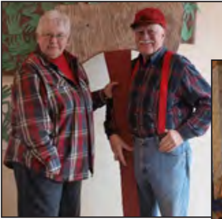
Lumberjacks