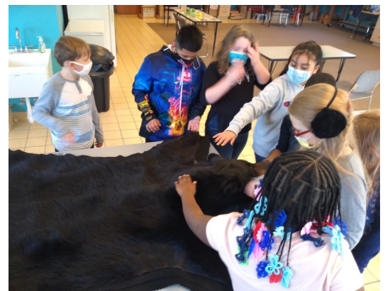
We were so happy to be back in person for field trips this fall. 4th graders from Cunningham Intermediate learned about the fur trade in Wisconsin in the 1800s.