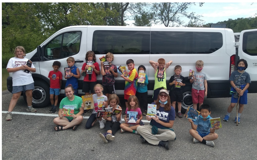
The SCF Bookmobile visited Big Hill in July, and each camper got to choose a book to take home. From 8-5:15 every weekday in the summer, we had campers out at Welty for a full day of nature-based fun.

One of my favorite quotes is "Tell me and I will forget. Teach me and I will remember. Involve me and I will learn." No joke: if you tell a child that acidic soil has a low pH and can influence plant growth followed by telling them to taste the soil, they'll never forget that acidic soil tastes sharp like citrus and will understand that soil pH affects plants. They also understand that we have a role to play as environmental stewards and act through fun activities such as trail maintenance and trash clean-up because we know that we have to minimize our impact.