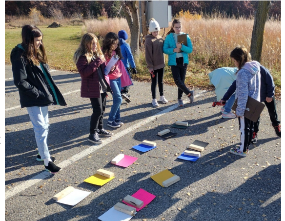
Students measure the surface temperature of the Big Hill parking lot, which varies depending on the color of paper. This experiment demonstrates how the built environment affects temperature and what can be done to prevent a “heat island”.