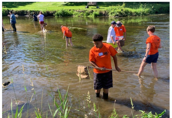
This summer we partnered with CareerTek on a day-long water science camp which included macroinvertebrate study in Turtle Creek and the Rock River.