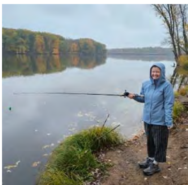
Top : Elle caught her first wall-eye this summer.