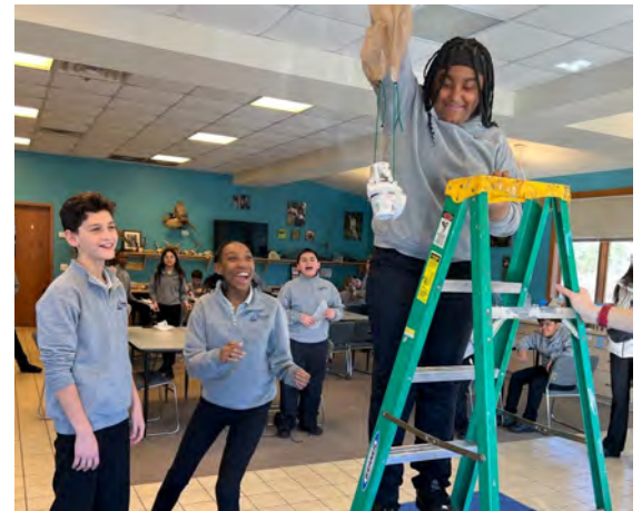
Above: Lincoln Academy 6-8th grade scholars experimented with egg drops during their Impending Impact field trips (see p. 3).