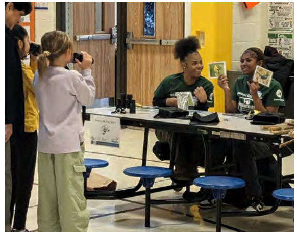
Thanks to a Morse Foundation grant, we are visiting every Beloit elementary school to present ecology fairs run by Community Action, Inc.'s Fresh Start.