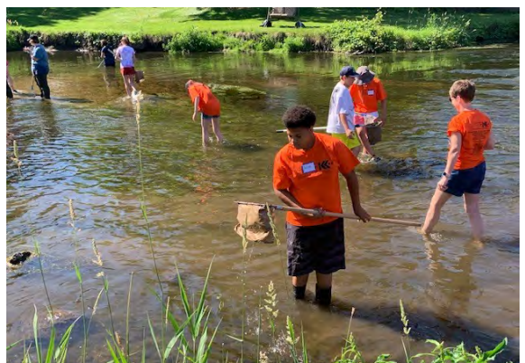
This summer we partnered with CareerTek on a day-long water science camp which included macroinvertebrate study in Turtle Creek and the Rock River.