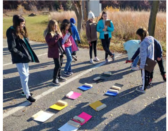
Students measure the surface temperature of the Big Hill parking lot, which varies depending on the color of paper. This experiment demonstrates how the built environment affects temperature and what can be done to prevent a “heat island”.